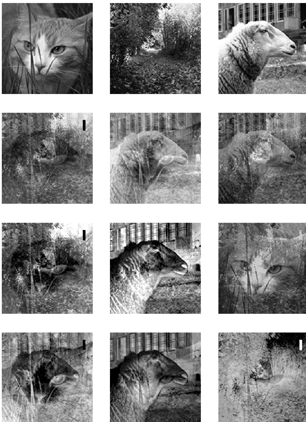
Figure 2: ICA for three pictures. The first row shows the original pictures, the second row the mixed pictures including some contamination. The third row used two robust scatter matrices ( E5 ) to recover the pictures and the fourth row the FastICA2 algorithm.